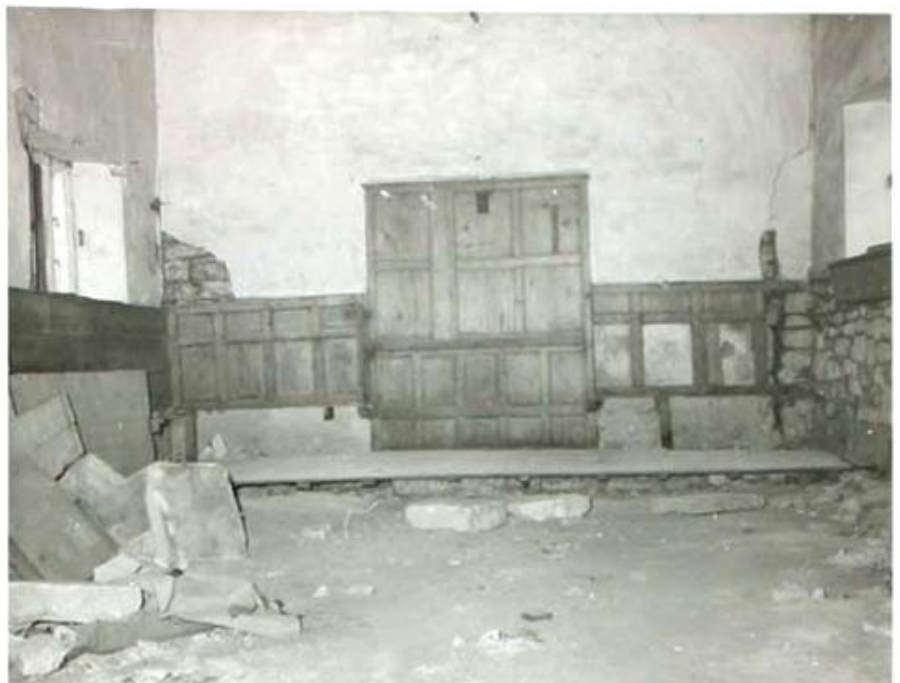
Figure 1: Interior of the meeting house in 1961 (Broad Campden Meeting House)