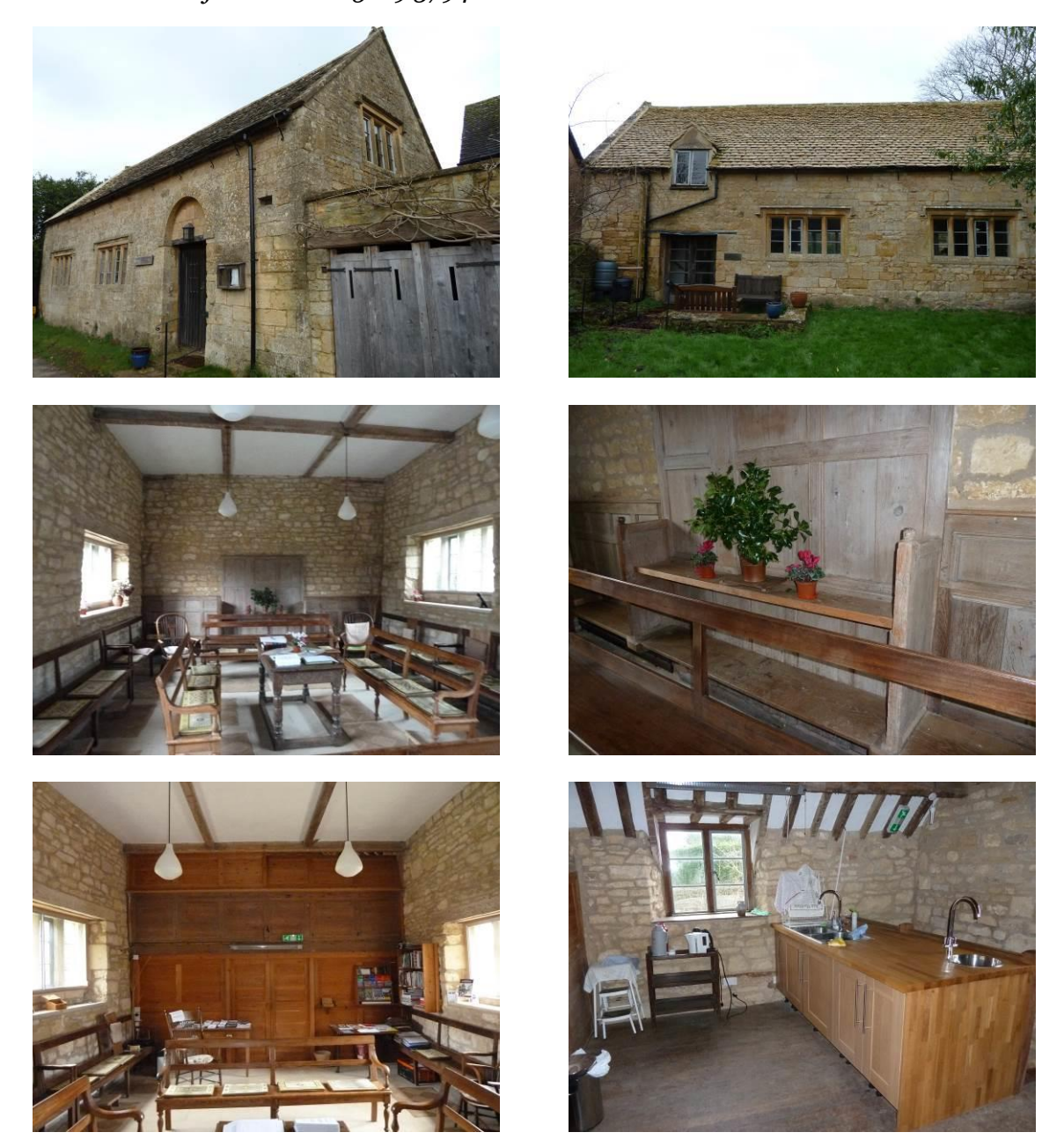
Statement of Significance

Meeting House Lane, Broad Campden, Chipping Campden, Gloucestershire, GL55 6US National Grid Reference: SP 15819 37941