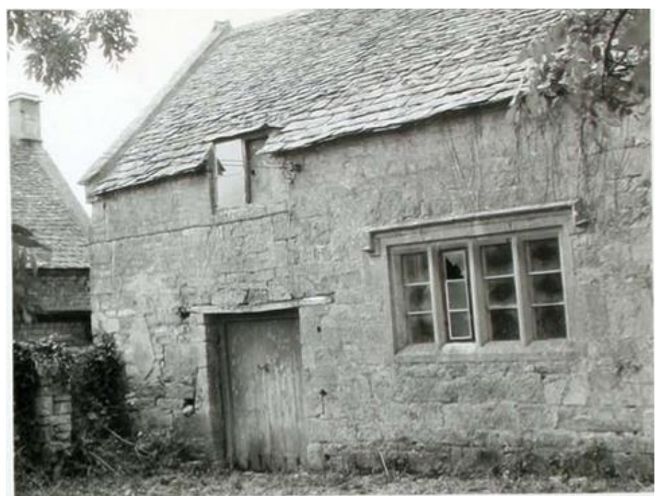
Figure 2: Rear elevation of the meeting house in 1961 (Broad Campden Meeting House)